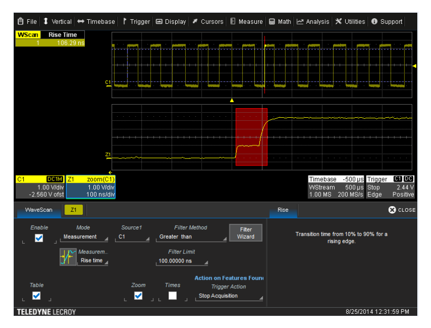
Figure 2: Here, WaveScan has found the glitch it was seeking in the input signal

One may direct WaveScan to find specific events in the signal trace, and define what event is being sought. In this example, WaveScan is looking for a glitch in the input signal from Figure 1. WaveScan is put in Measurement mode, with the measurement being rise time. The filter method is "greater than" with a filter limit of 100 ns. The glitch is shown in Figure 2.